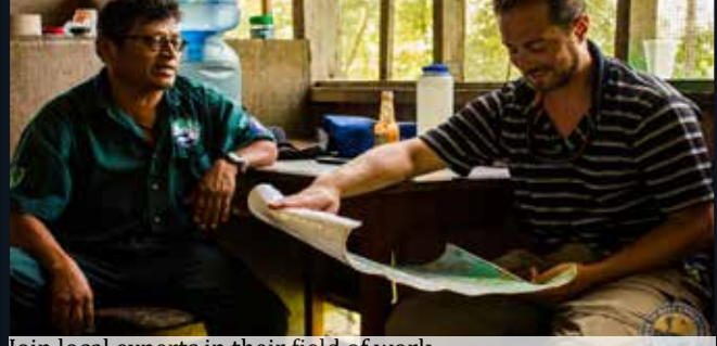
Join local experts in their field of work