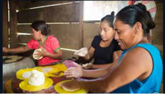
L<mark>ocal Mayan Women dem</mark>onstrate traditional Corn Tortilla making.

As part of the study abroad program, there are options for students to explore the Toledo District with our parent company TIDE Tours who will show them the hidden gems in that exist in Belize.