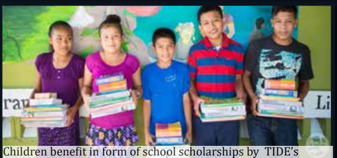
Children benefit in form of school scholarships by TIDE's proceeds.

R2R volunteers work alongside local experts in the field – Belizean scientists, educators and park rangers who care passionately about the areas we work in. With the staff team being so connected to the areas and communities, it is easier for students to understand the benefits and impacts that their efforts will have.