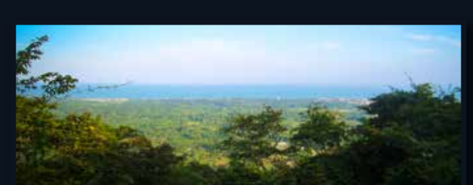
Explore the Maya Mountain Marine Corridor and it's forests, rivers and reefs