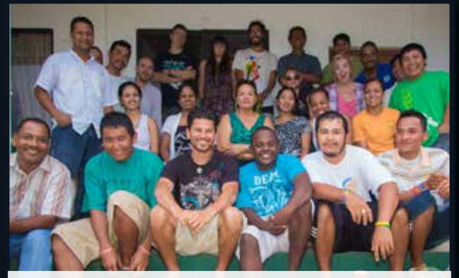
TIDE staff and volunteers outside the offices in Punta Gorda

With our Study Abroad Program your students have the opportunity to practice sustainable solutions to complex issues through knowledge exchange and hands-on experience. Individual benefits to your students will include: